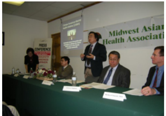
Mental health press conference in Chicago's Chinatown.

Matrone and Leahy (2005) monitored the effectiveness of diversity in rehabilitation customer outcomes for 118 counselors. Although competencies, which can be addressed by training, did not significantly explain outcome differences, customer and counselor race did. Bellini (2003) found that clients from different racial groups experience different outcomes as a function of their counselors' race and their counselors' multicultural competency. According to Bellini, non-White clients of average age working with non-White counselors are more likely to have a successful closure than White clients of average age working with counselors of any race. Non-White clients receiving social security benefits working with a non-White counselor are more likely to have a successful closure than White clients receiving social security benefits working with a counselor of any race. This study clearly indicates that multicultural counselors are vital for successful customer outcomes in a way that even simple cultural competency training alone cannot duplicate.